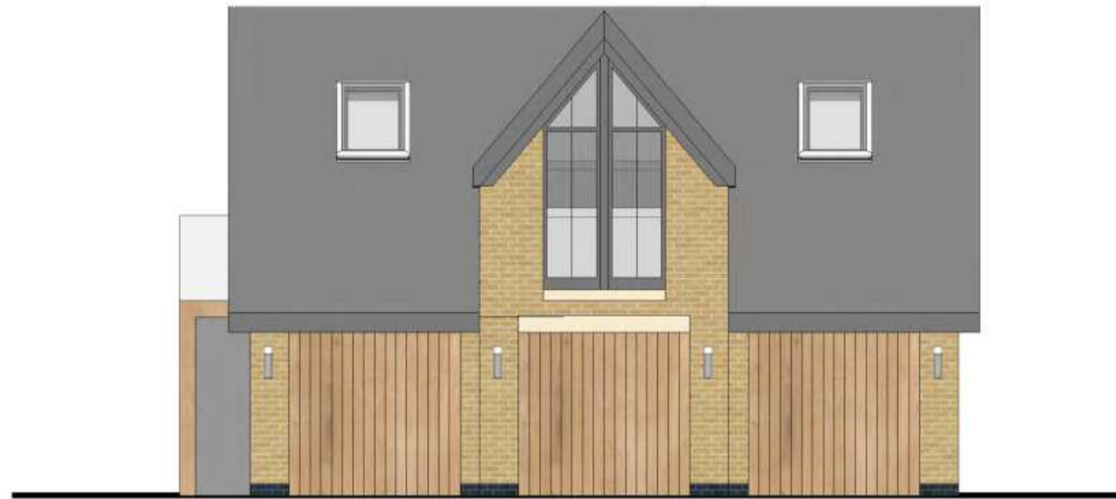
Front Elevation 1:50