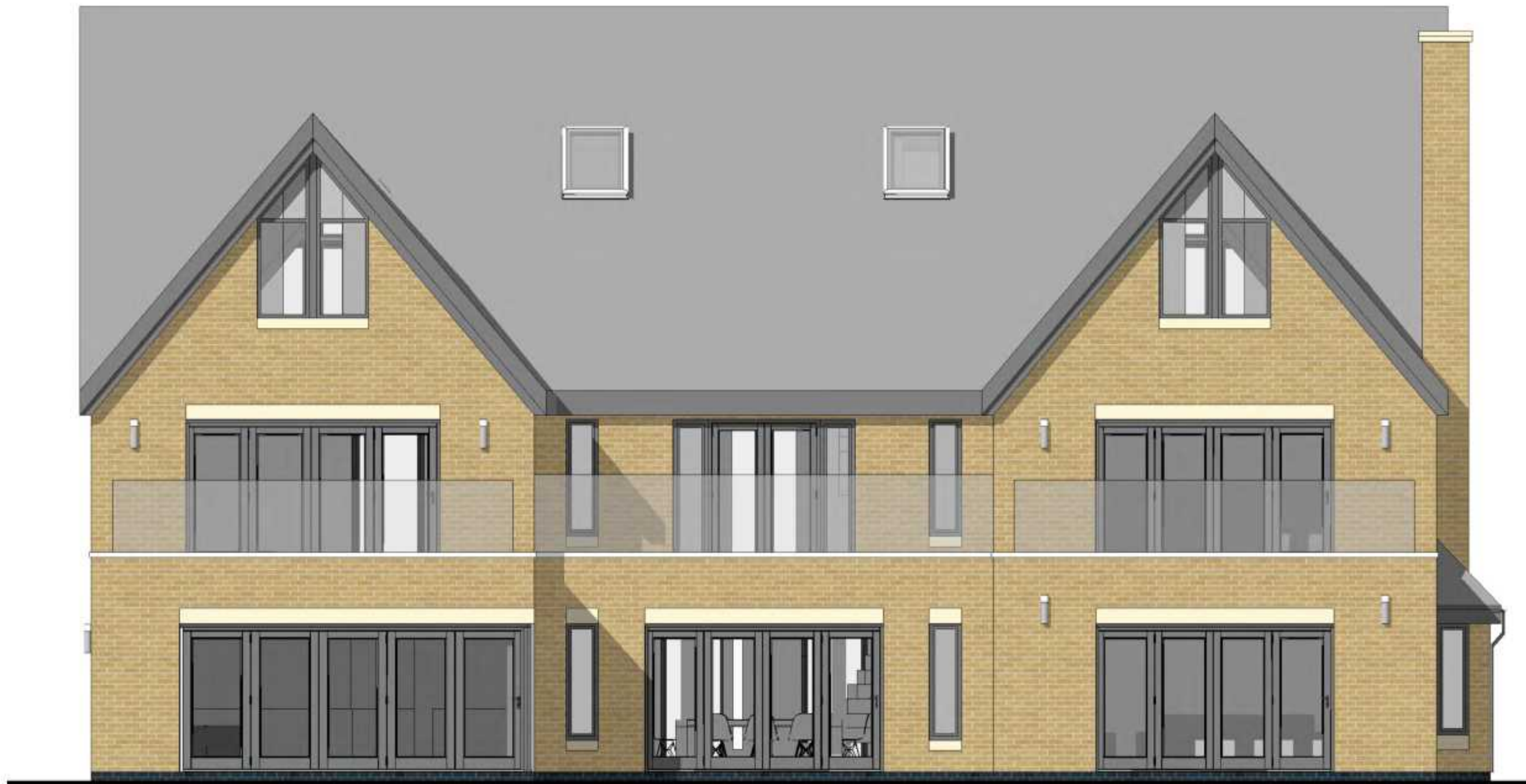
Rear Elevation 1:50