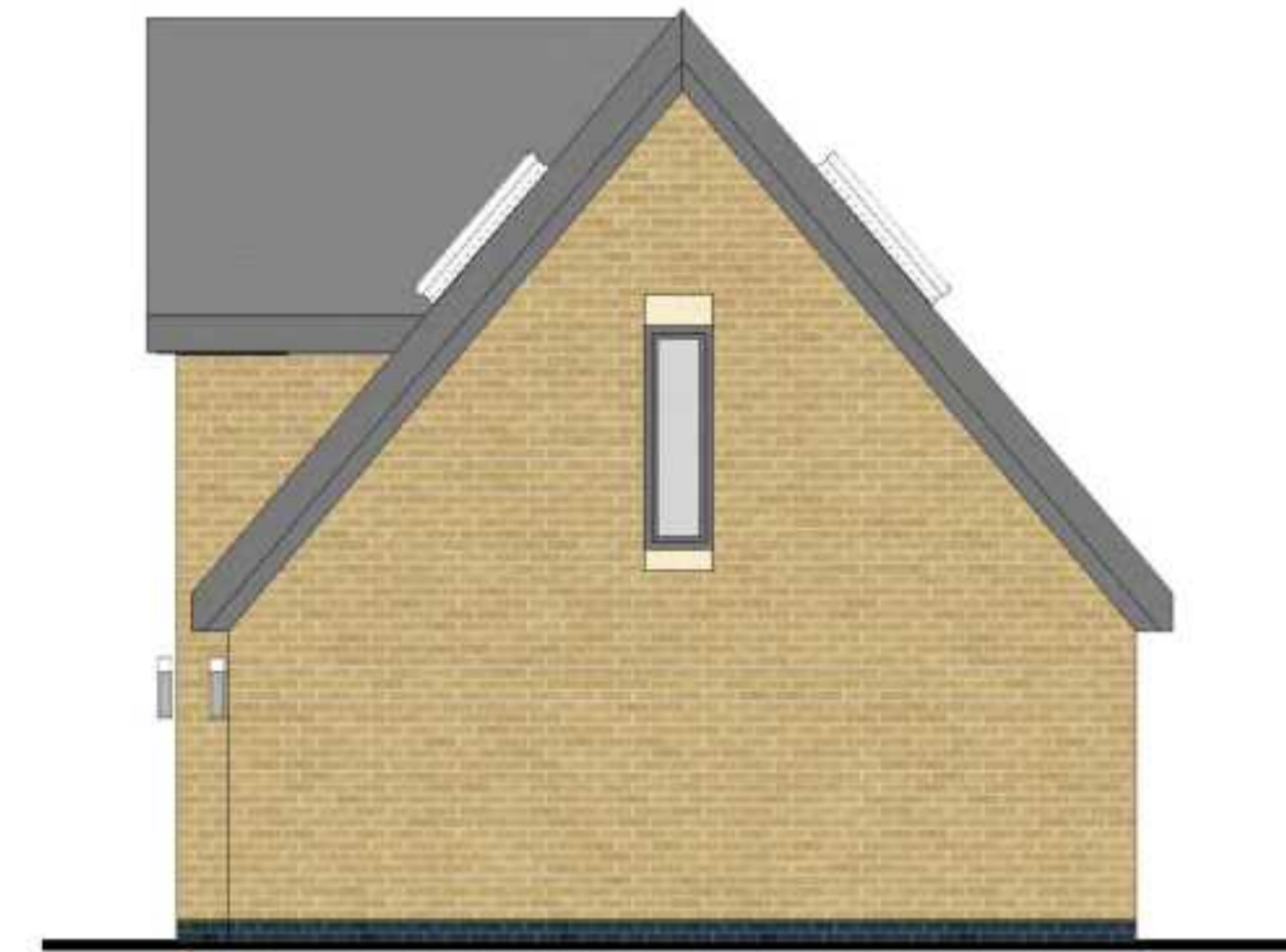
Side Elevation 1:50