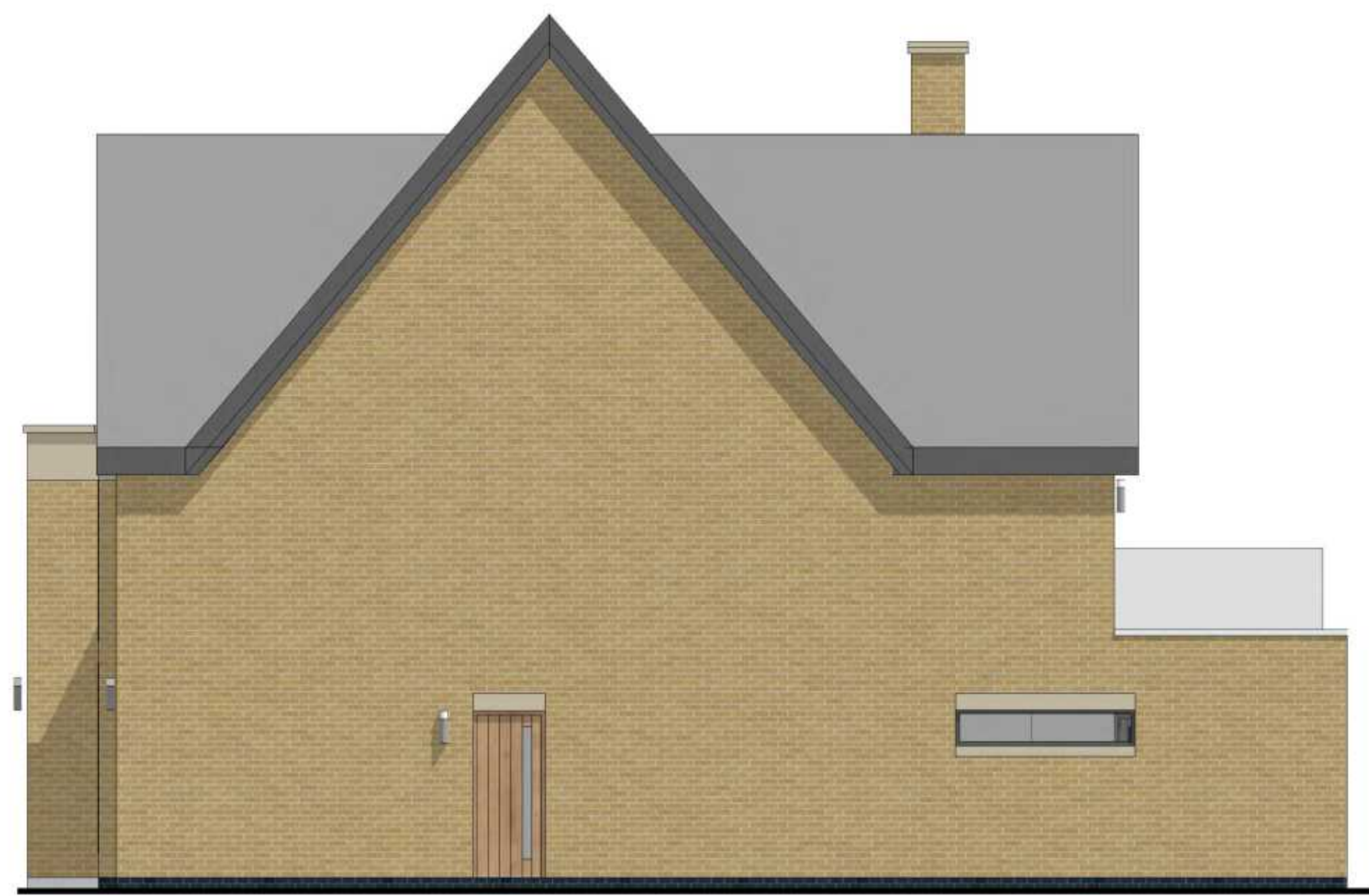
Side Elevation 1:50