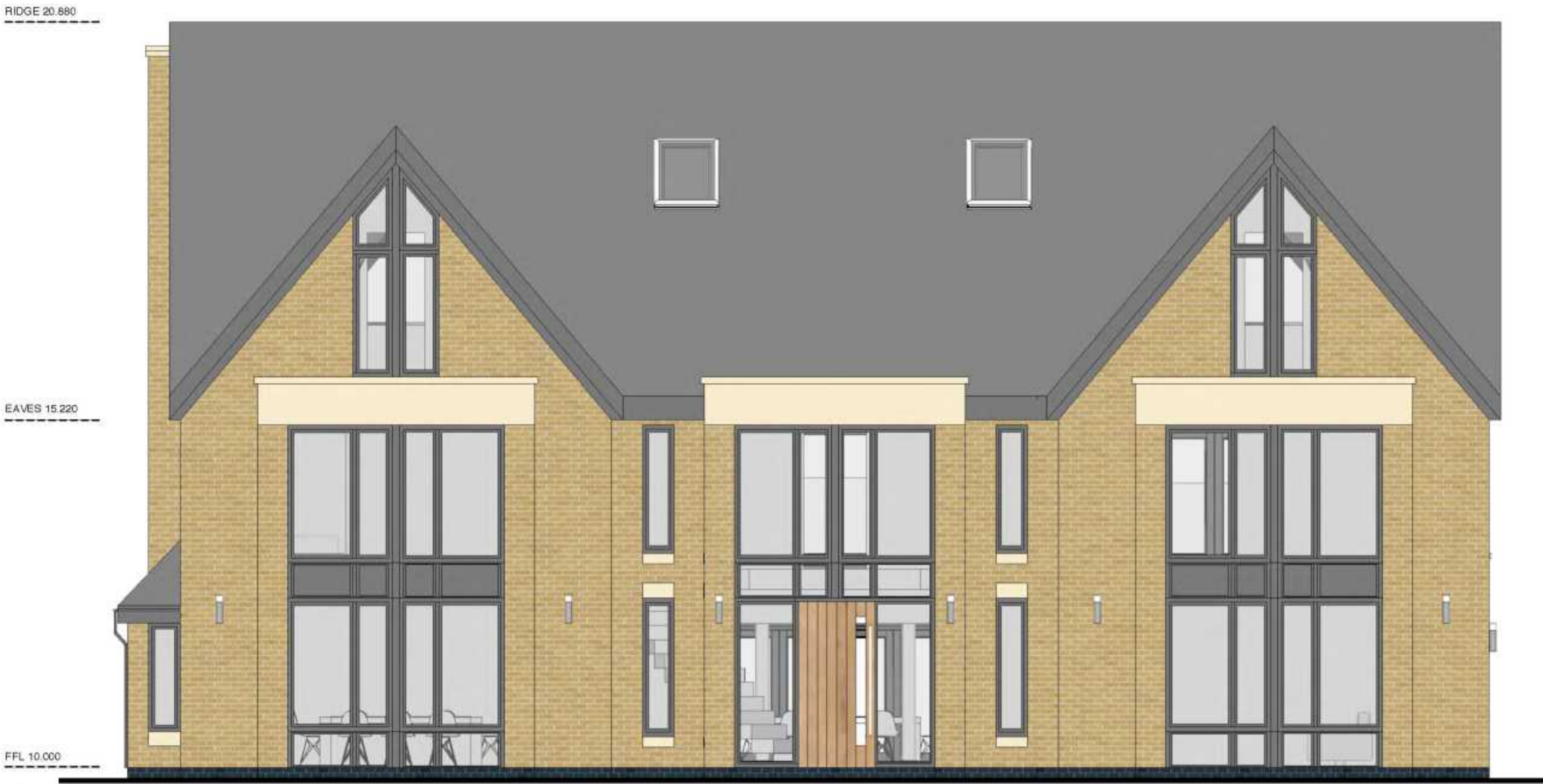
Front Elevation 1:50