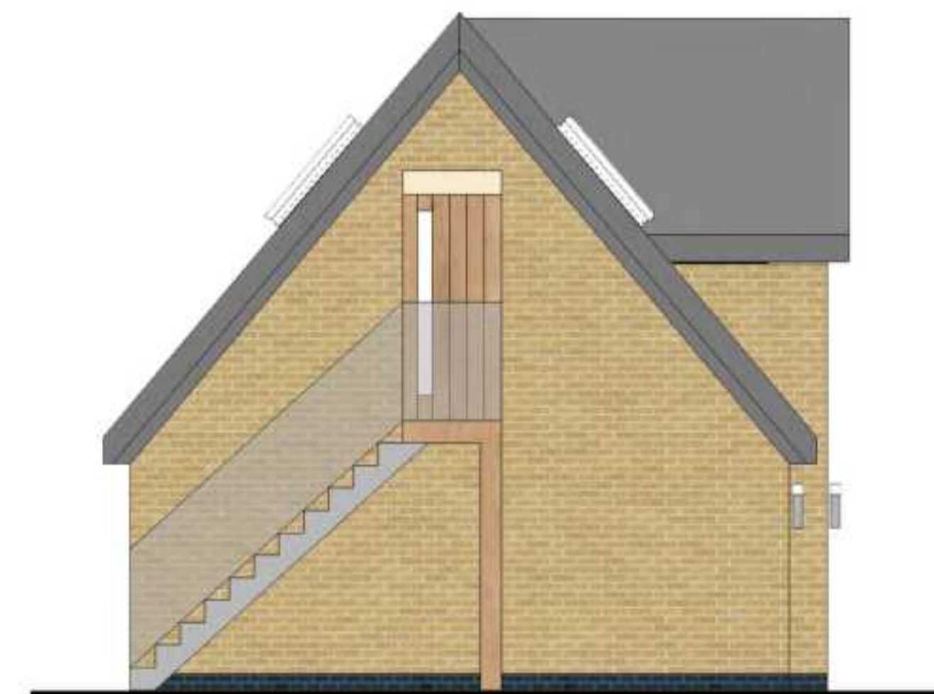
Side Elevation 1:50